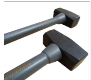
4 kg sledgehammer' s head