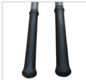
Electrical shocks' rubber protection handle