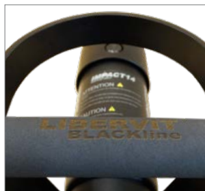
grip handle with protection guard