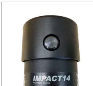
removable protection top

A tactical backpack EBP-A has been designed to transport on your back a IMPACT14 battering ram, a sledgehammer, and a bolt cutter (Entry kits chapter).