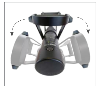
anti-noise lateral rubber side protection