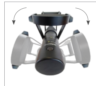
anti-noise lateral rubber side protection