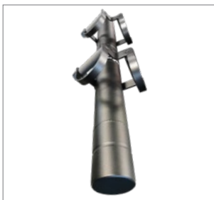
battering ram MR30

The LIBERVIT MR series battering rams are a standard within our entry tools.