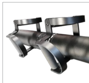
4 solid handles