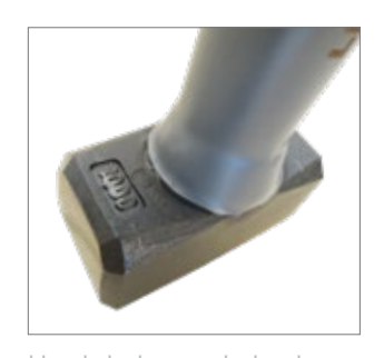
1 kg sledgehammer' s head