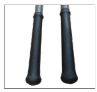
electrical shocks' rubber protection handle