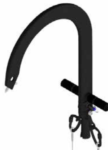
REBS 13" Aluminium Hook