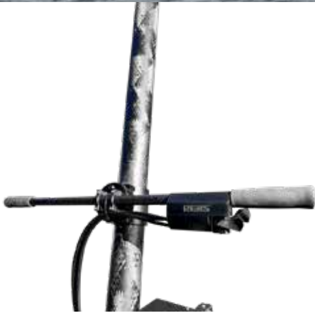
A new Handle is developed for the Sky Pole.